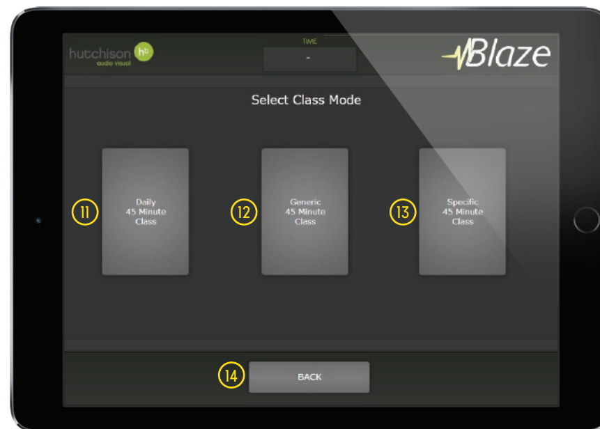
CLASS MODE SCREEN