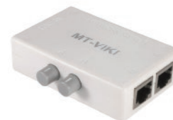
OVERRIDE SWITCH TYPE 1