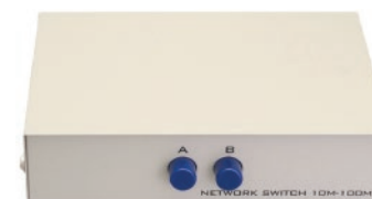
OVERRIDE SWITCH TYPE 2